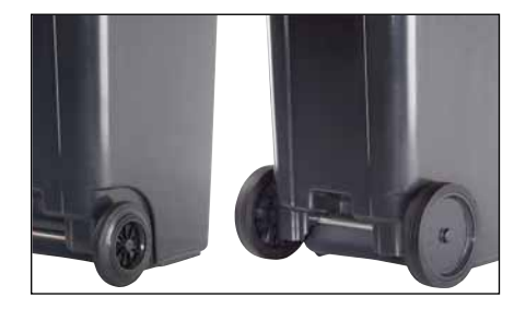
Wheel diameter 200 or larger (option)