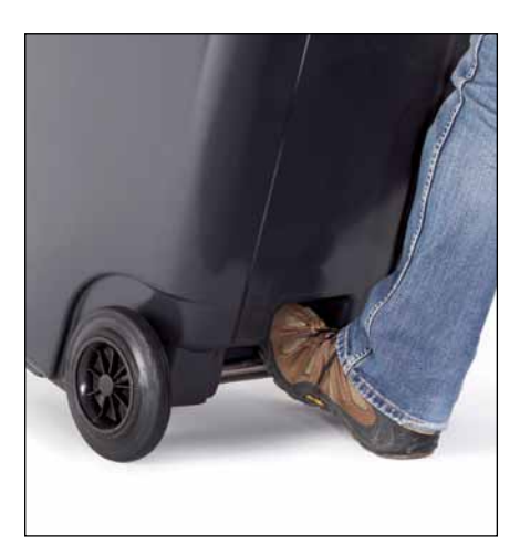
Ergonomic foot step