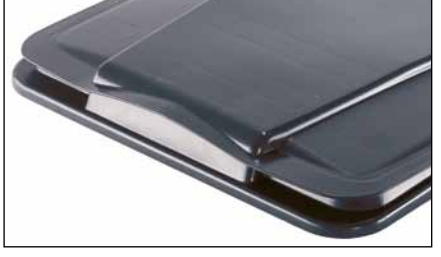
SL lid with handle strip on three sides