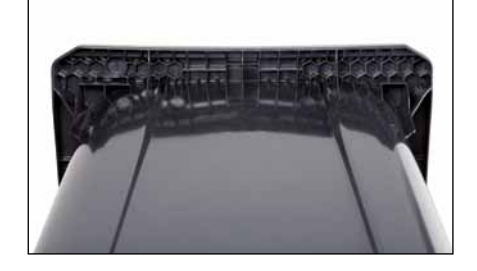
Robust comb receiver for lifting and emptying