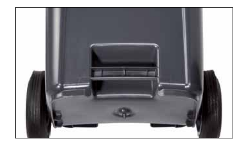
120 SL with optional third handle