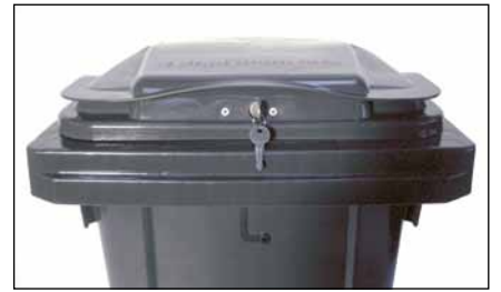
Gravity lock on request